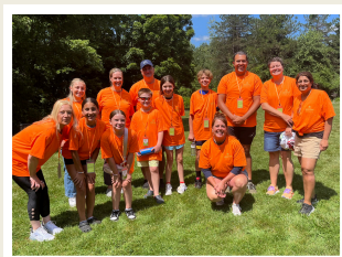
iC.A.R.E. Mentor & Mentee